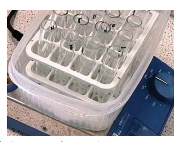
Figure 2. Arrangement of ice-water bath over a magnetic stirrer for treatment of samples with 2 M KOH and dissolution of RS.