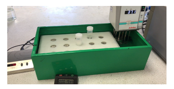
Figure 2. Incubation Method 1. Samples ( \sim 0.5 g) in 40 mL, 30 x 84 mm polypropylene tubes in a designed polypropylene tube holder (Megazyme cat. no. D-PPSTH ) [C(w)] on a 2mag Mixdrive 15<sup>®</sup> submersible magnetic stirrer in a custom made water bath (Megazyme cat. no. D-TDFBTH ). This arrangement allows stirring of 15 samples at controlled speed (170 rpm) and 37°C.

NOTE: These calculations can be simplified by using the Megazyme Mega-Calc <sup>TM</sup>, downloadable from where the product appears in the Megazyme web site (www.megazyme.com).