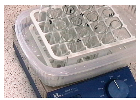
Figure 4. Arrangement of ice-water bath over a magnetic stirrer for dissolution of resistant starch in 1.7 M NaOH.