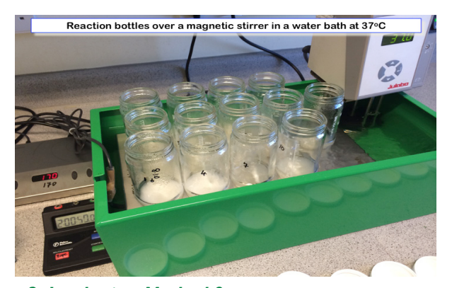
Figure 3. Incubation Method 2. Samples ( \sim 1.0 g) in Fisherbrand bottles on a 2mag Mixdrive 15<sup>®</sup> submersible magnetic stirrer in a custom made water bath (Megazyme cat. no. D-TDFBTH ). This arrangement allows stirring of 15 samples at controlled speed (170 rpm) and 37°C.